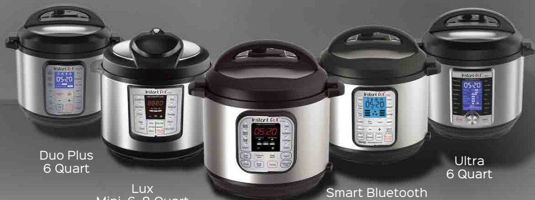
Duo Plus 6 Quart

The Instant Pot® Family of Products Multi-Use Programmable Pressure Cookers