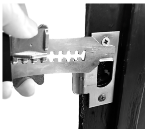
(Position of strike plate on left side.)