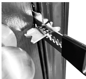
(Installed & In Locked Position)