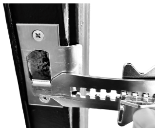
(Position of strike plate on right side.)