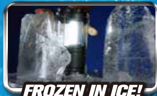
FROZEN IN ICE!